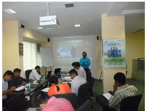
Videocon Ind. Ltd. on “Behavioural/Sales Skills”