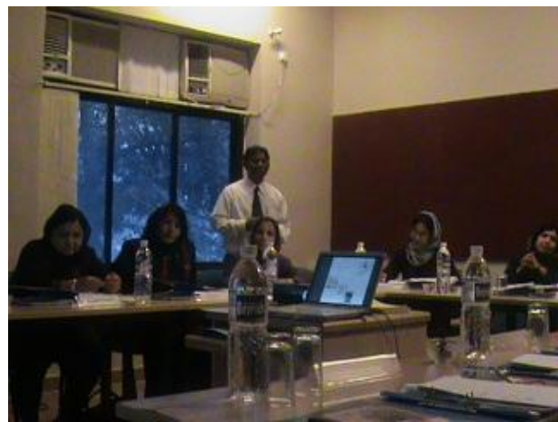
Faculties of Govt. Engg. Colleges, Kabul, Afghanistan on “Facilitation Skills”