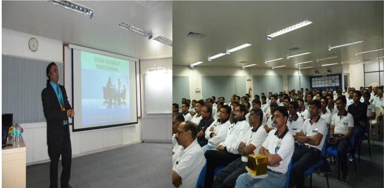
Delivering 'Multiple Intelligence' at Bajaj Auto Ltd., Aurangabad, 27 th Nov 2013