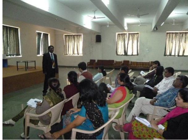
Mentor at many b-schools for Students as well as their Faculties