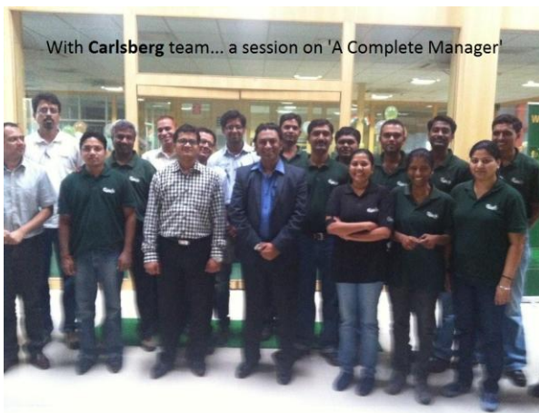
Carlsberg on "Complete Manager"