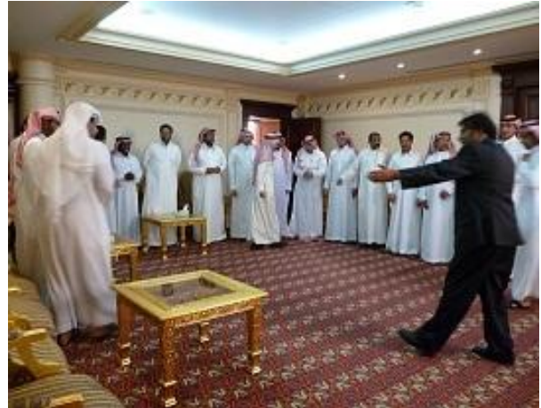
Saudi Ground Services (Saudi Arabian Airlines) Riyadh & Jeddah on "Supervisory Skills"