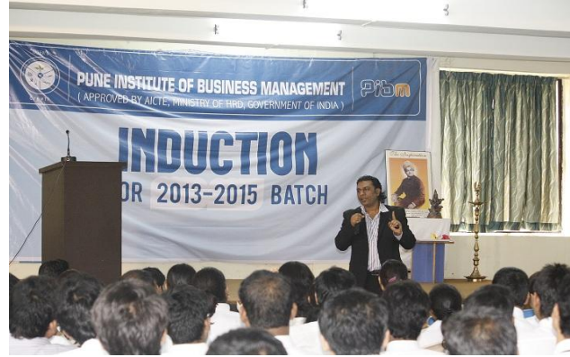
“Actively contributing at b-schools and engineering colleges”