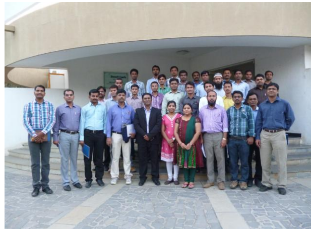
Presentation Skills for Wockhardt