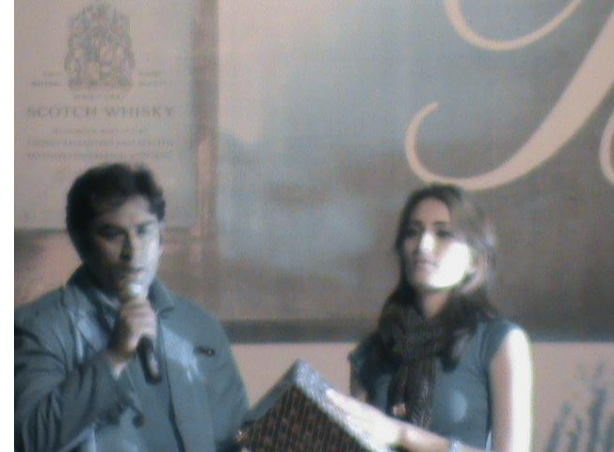
Teachers, Doctors, Lawyers etc. "Social Entrepreneurship Skills/Great Teacher"