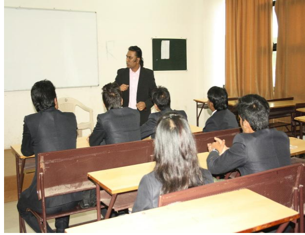
B-Schools/Engg. at Pune on "Campus to Corporate"