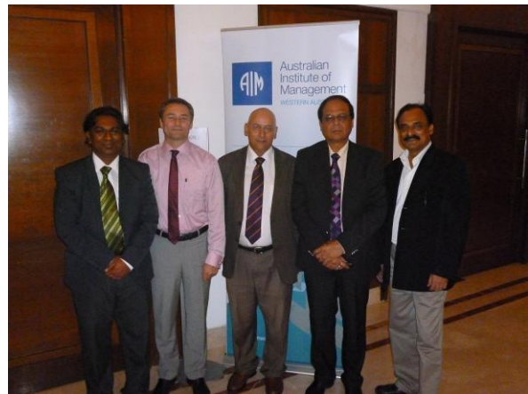
TTT by Australian Inst. Of Mgmt, Western Australia